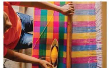
Lenca Weaving, Honduras