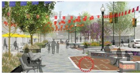
La Placita Family-Friendly Seating Areas